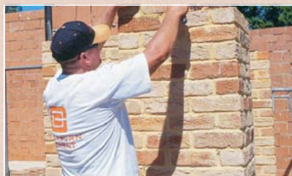
Hylime is not to be used for making concrete. Hylime is not to be used for set coats.

Cockburn Hylime will also enhance the durability of mortars as the high water retention prevents excessive absorption of water from the mortar into masonry units. The longer the water is retained in mortar, the better the cement will cure, thus enhancing the ultimate strength development of the mortar. Bond strength is also enhanced by the high plasticity imparted by Hylime . This enables the mortar to be squeezed into the cores and pores in each masonry unit thus improving both bond and the seal against the ravages of the weather.